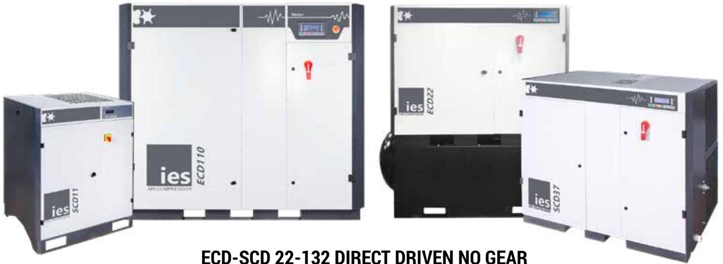
ECD-SCD 22-132 DIRECT DRIVEN NO GEAR